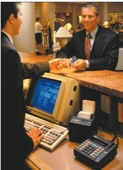
T8 terminal in a lodging environment

Faster dial access response times and reduced communication costs ensure lower operating costs with the T8.